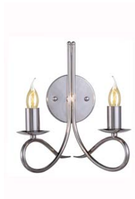
Polished Nickel Item No:1452W9PN